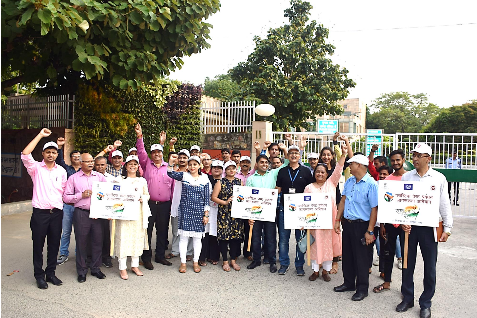
Activities undertaken by NIB during “Swachhta Hi Seva” campaign, 2019- theme “Management of Plastic Waste”: 11 Sep – 01 Oct 2019