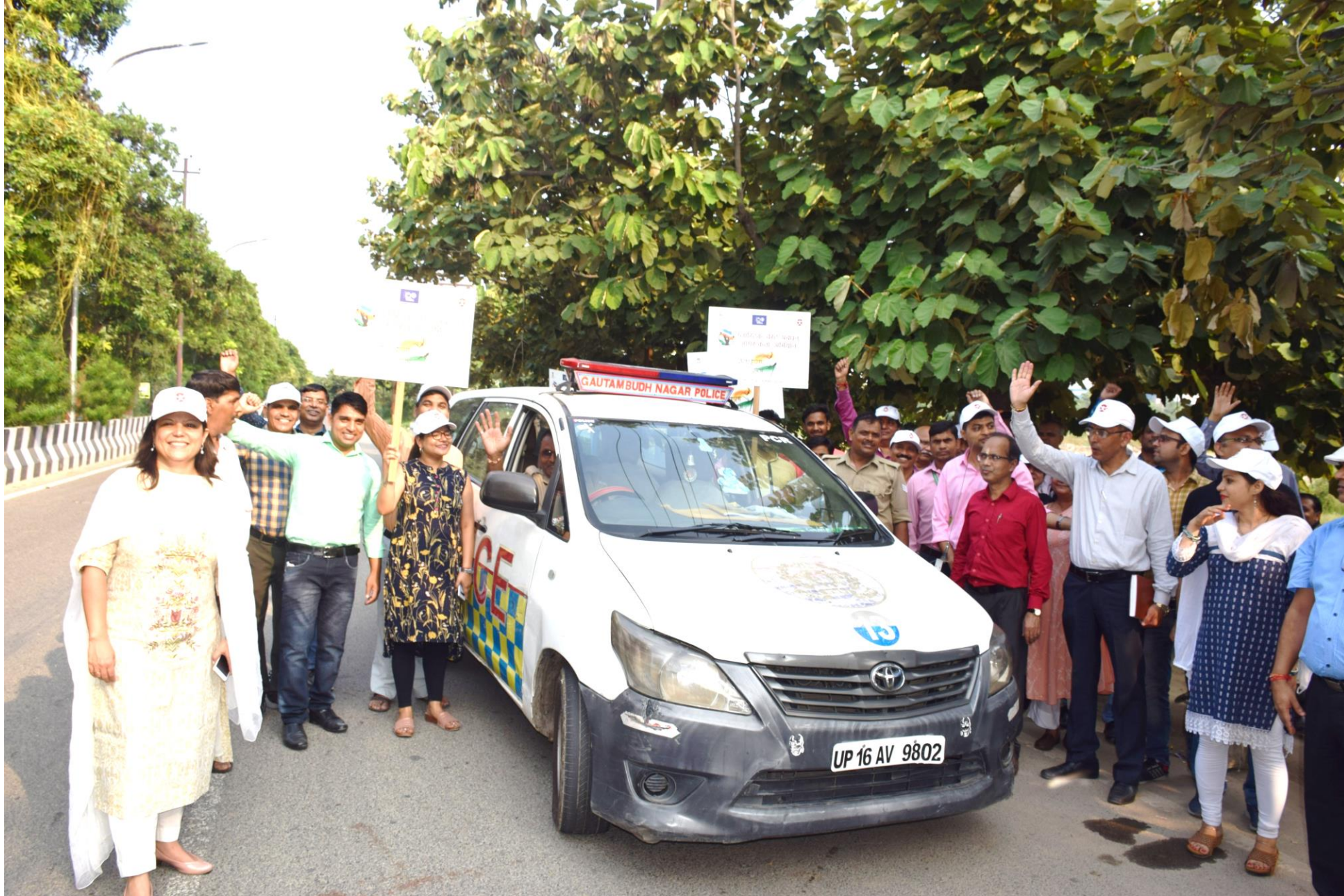
Activities undertaken by NIB during “Swachhta Hi Seva” campaign, 2019- theme “Management of Plastic Waste”: 11 Sep – 01 Oct 2019