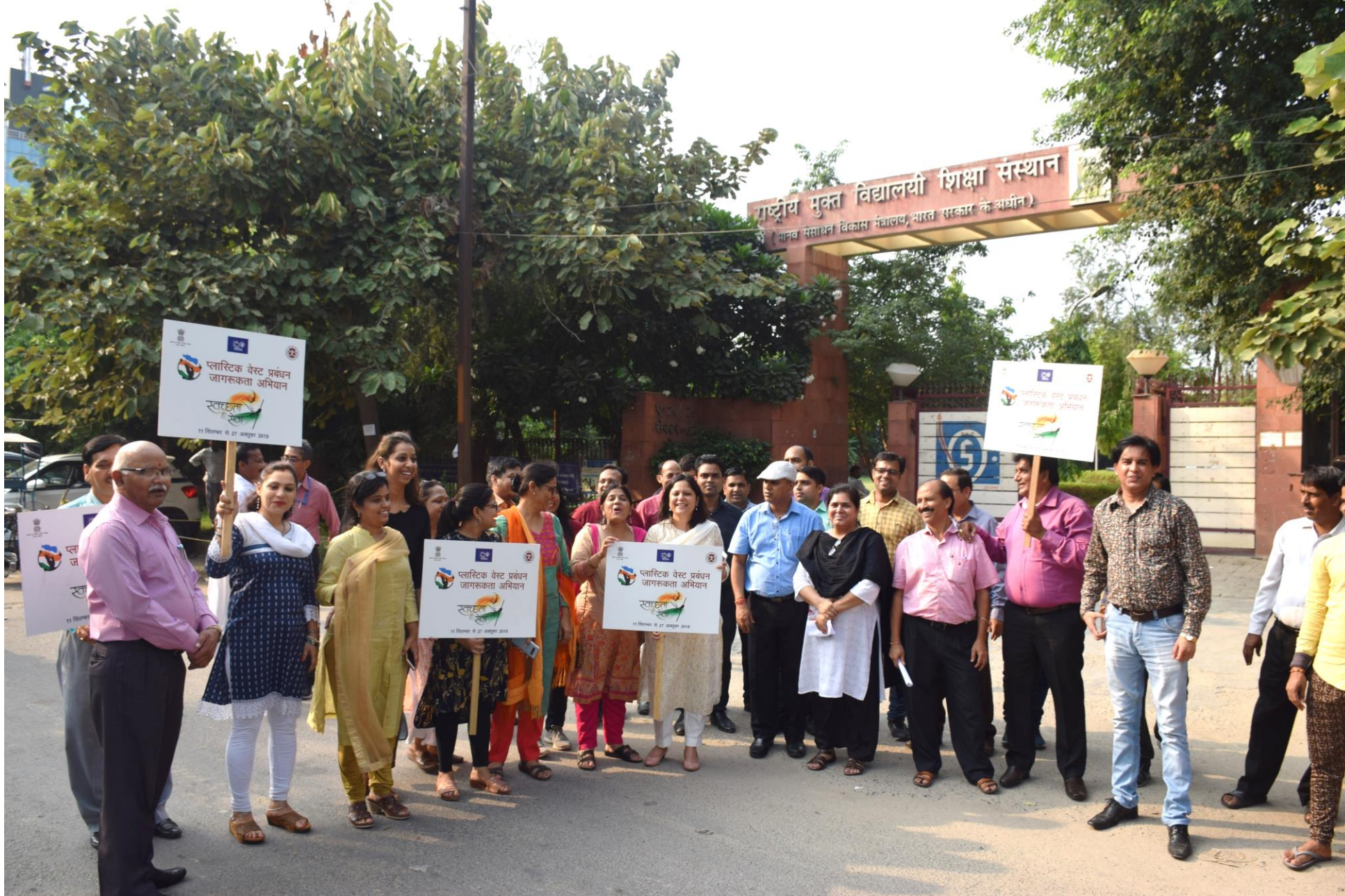
Activities undertaken by NIB during “Swachhta Hi Seva” campaign, 2019- theme “Management of Plastic Waste”: 11 Sep – 01 Oct 2019