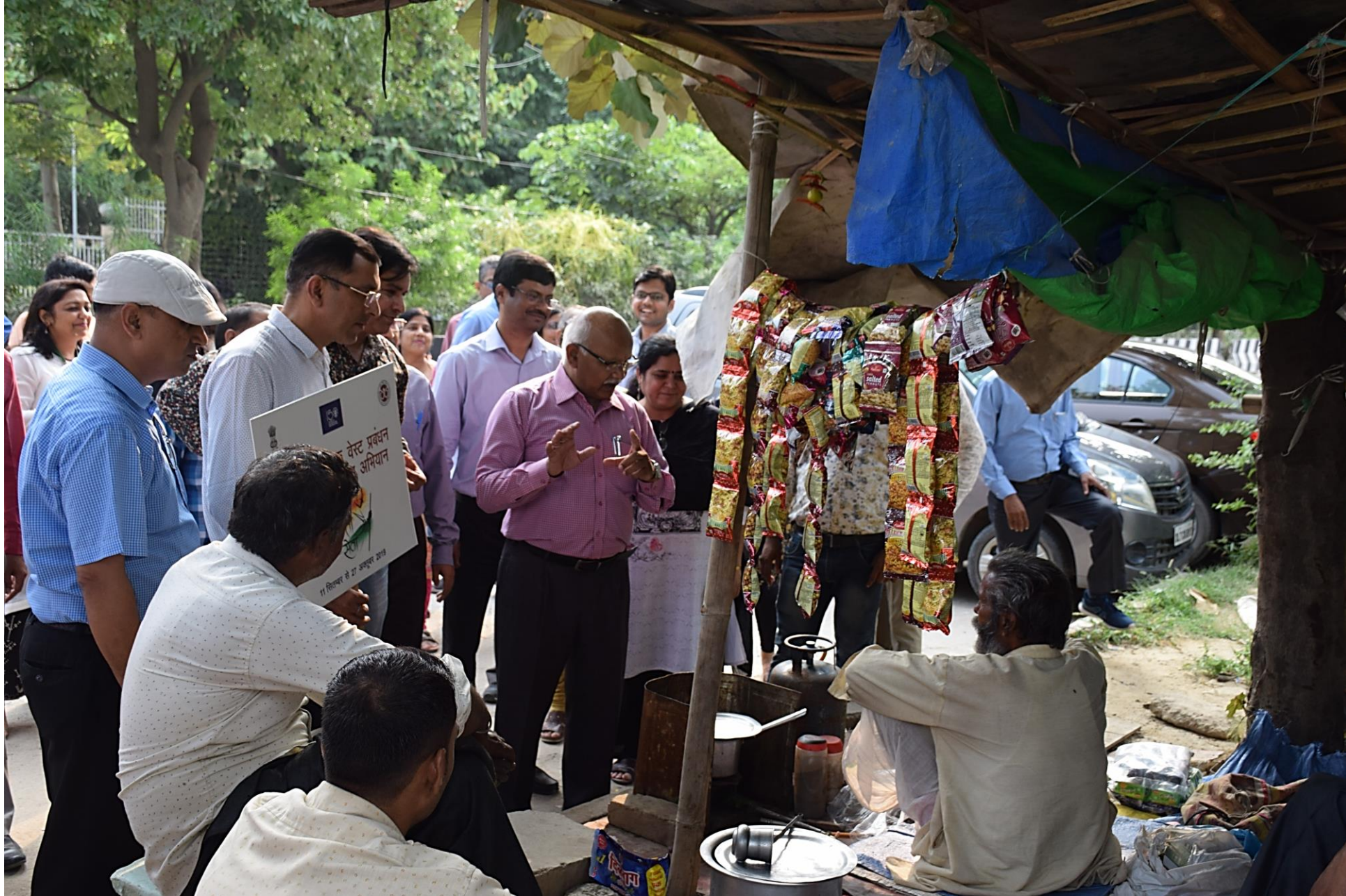
Activities undertaken by NIB during “Swachhta Hi Seva” campaign, 2019- theme “Management of Plastic Waste”: 11 Sep – 01 Oct 2019