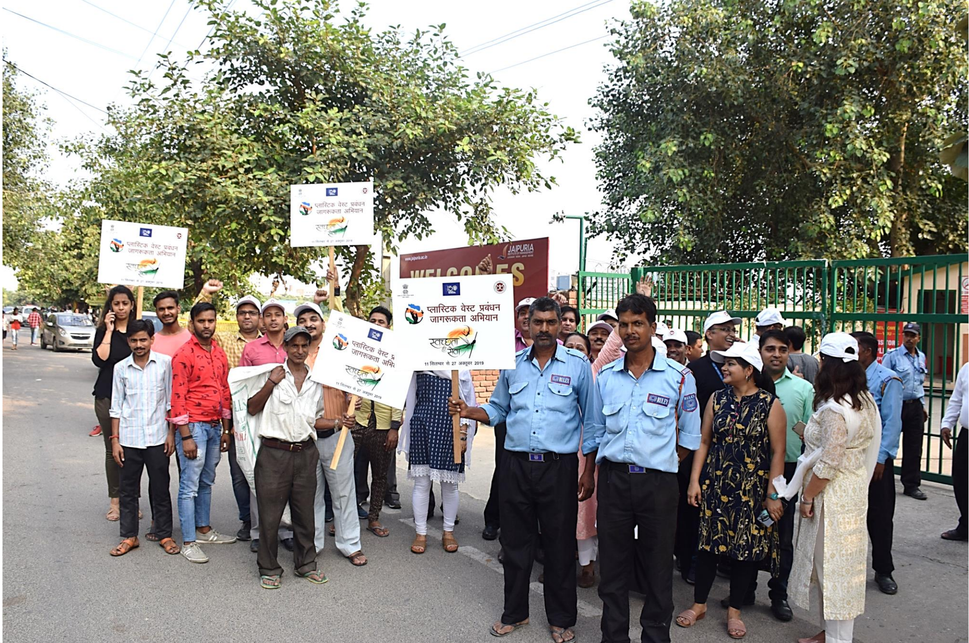
Activities undertaken by NIB during “Swachhta Hi Seva” campaign, 2019- theme “Management of Plastic Waste”: 11 Sep – 01 Oct 2019