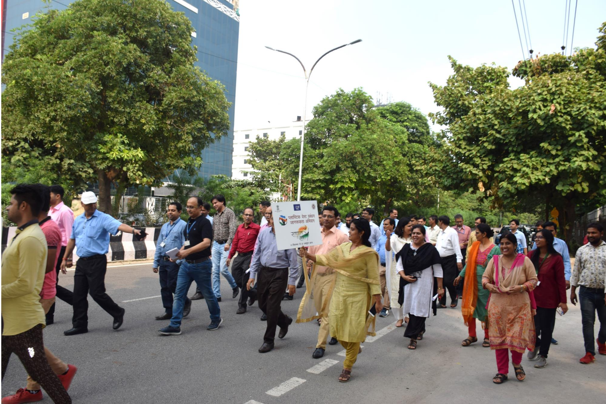
Activities undertaken by NIB during “Swachhta Hi Seva” campaign, 2019- theme “Management of Plastic Waste”: 11 Sep – 01 Oct 2019