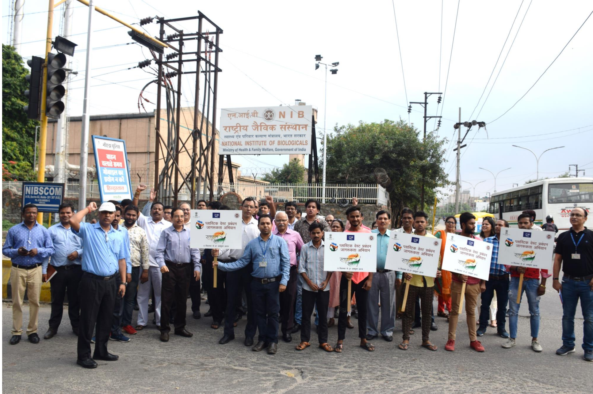
Activities undertaken by NIB during “Swachhta Hi Seva” campaign, 2019- theme “Management of Plastic Waste”: 11 Sep – 01 Oct 2019