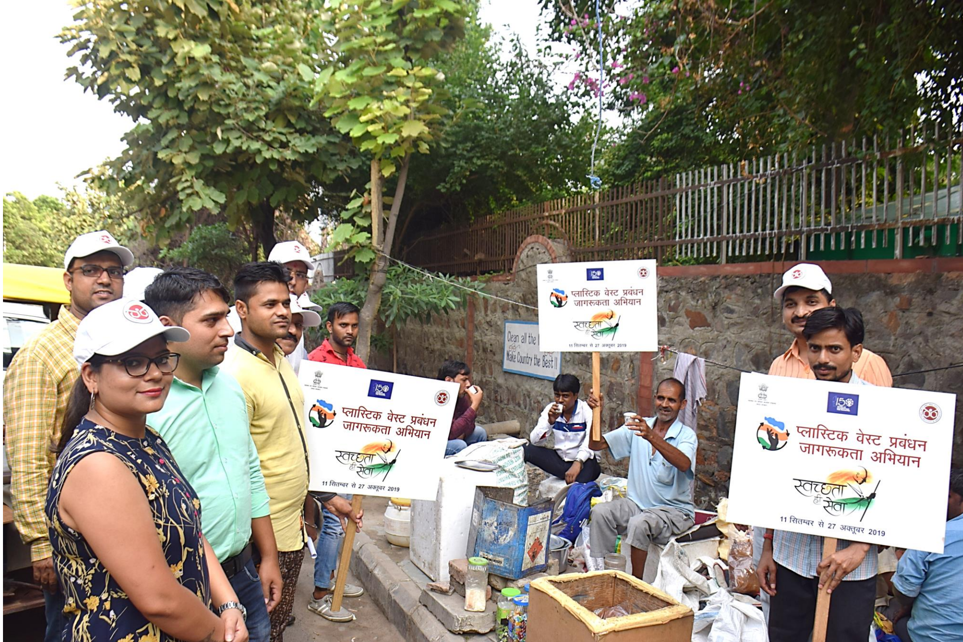
Activities undertaken by NIB during “Swachhta Hi Seva” campaign, 2019- theme “Management of Plastic Waste”: 11 Sep – 01 Oct 2019