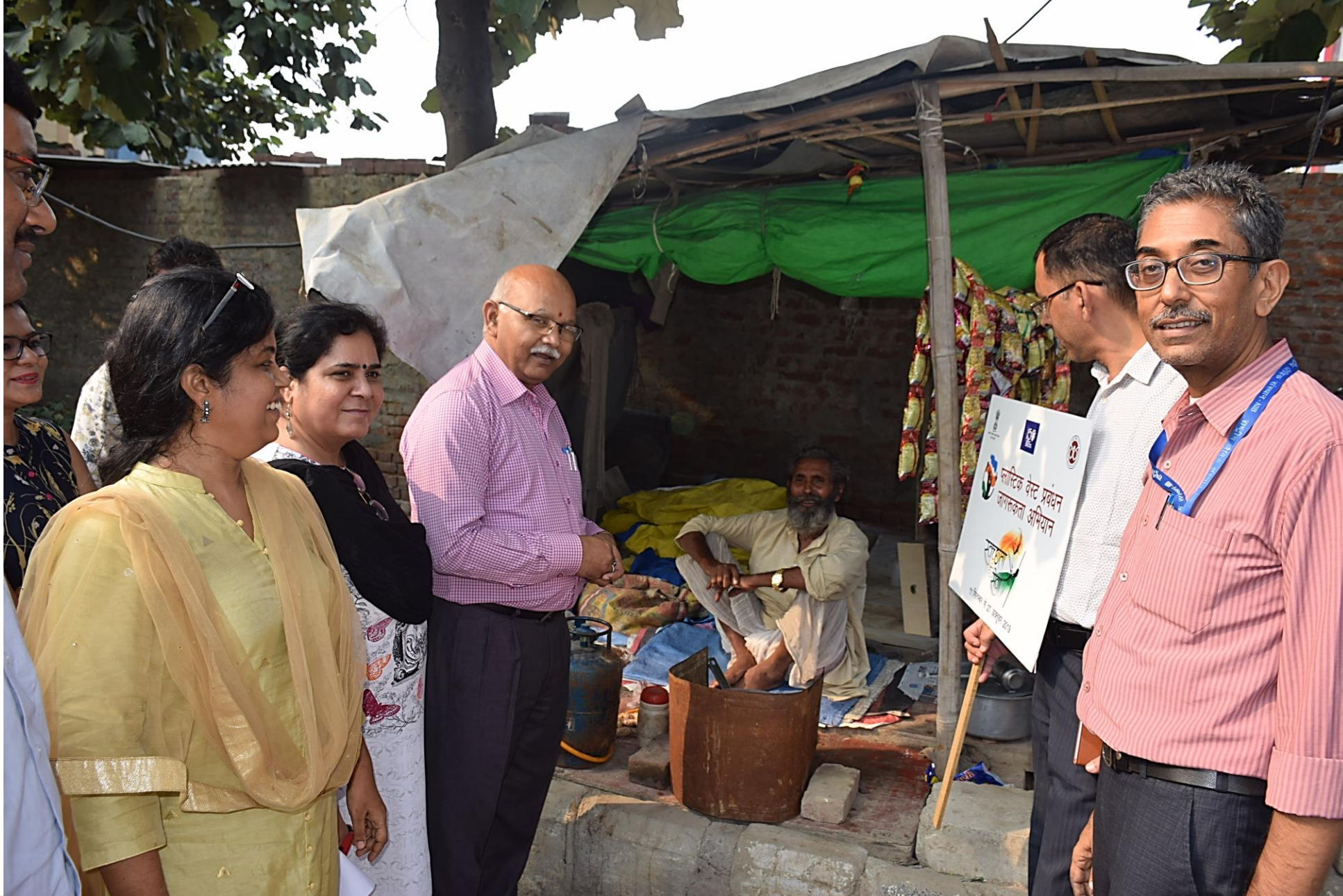
Activities undertaken by NIB during “Swachhta Hi Seva” campaign, 2019- theme “Management of Plastic Waste”: 11 Sep – 01 Oct 2019